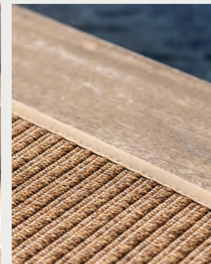
_05_ below&cover stone 375 with easy 305