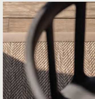
_03_ stone rustique 732 with easy 315