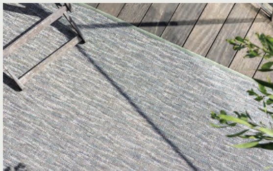
_02_ stone colors 887 with dune 700

Enjoy every sensation on the "menu": touch that cold travertine stone with your hands and feel that cosy feeling of having a nice rug under your bare feet. With eyes wide open, see beyond obvious colour combos, go for creative texture partnerships as well. You should enjoy every minute of your day. Your home is the epicentre of the creative "storm" ahead.