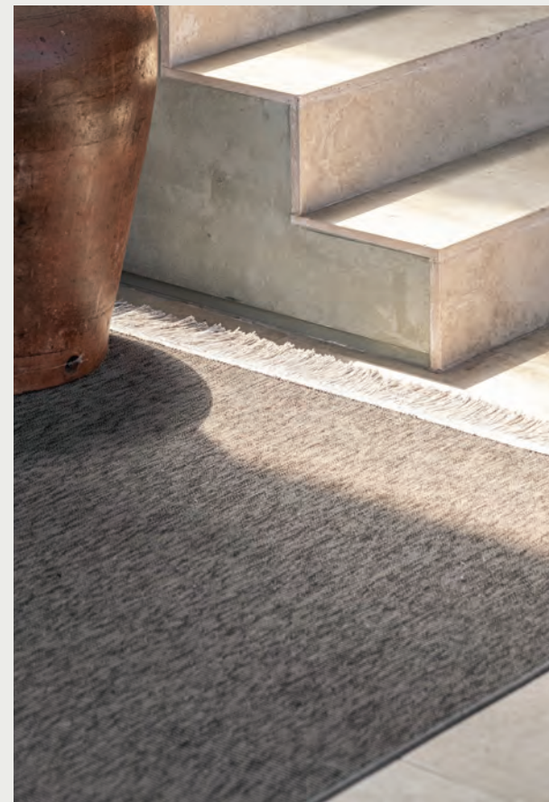
_04_ stone contract 580 with franja